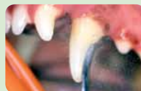
Removing the calculus using an ultrasonic scaler, followed by polishing the teeth is a very effective form of treatment