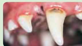
(2) Gingivitis – with early calculus