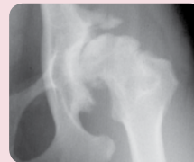
X-ray of an arthritic hip joint in a dog. The symptoms of arthritis are often much worse in overweight pets.