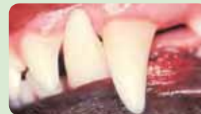
(1) Healthy mouth